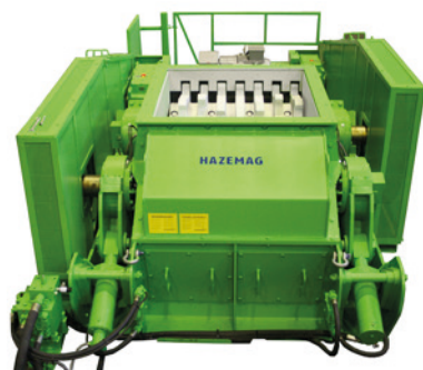
HAZEMAG Roll Crusher | HRC